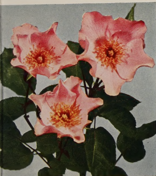
CL. DAINTY BESS